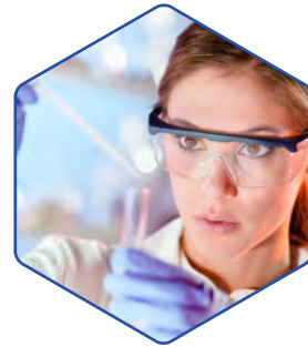
Pharmaceutical & Biotech

Lee Plastic promises to deliver superior-quality precision analytical instruments with competitive pricing and a remarkable customer experience.