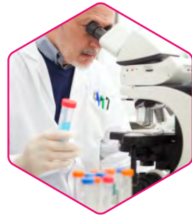
Health & Education